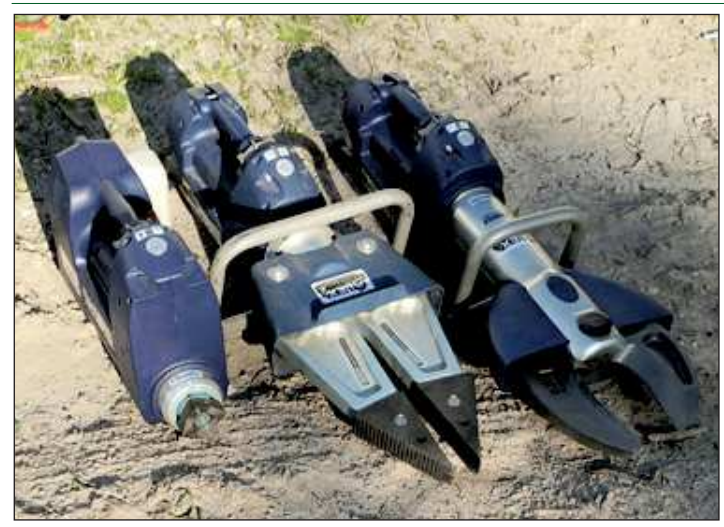
New Hurst Battery Powered Tools

• At the end of last year, with the help of the Selectboard, we found the money to finally replace our badly outdated and dysfunctional jaws tools. We had been running for over a year with a loaner tool from our good and generous neighbors at New Boston Fire. We now have cutting edge technology with our battery operated jaws. We will be demonstrating them at our open house.