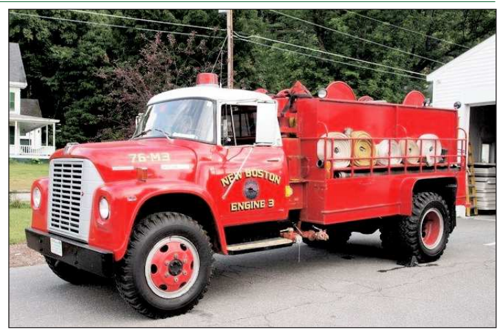
Greenfield's New Brush Truck

Brush truck to water their roads. I had previously tried to buy this wonderful old Brush unit. We swapped... no dollars exchanged. They got what they needed and repaired the tank. We got an awesome heavy duty Brush unit that doubles as an engine. It has all wheel drive and 1,000 gallons of water. The average brush truck carries 250 gallons. This truck will be able to bring 1000 gallons up some of our very steep driveways in winter... that's huge! We had originally budgeted $20K to replace our old tired brush unit. Thanks to some good fortune and generous "in-kind" donations from Peterborough Collision (bodywork) and Steve's Lettering in Jaffrey (lettering) we are only into the brush unit for $4000. The new Brush truck is not quite finished, so the picture is when it was still New Boston's truck. If you are wondering about the tanker, we are working on replacing it and pursuing grant money as we speak. Thankfully, with the increased water capacity of the Ladder and new Brush Truck, we can limp along for a bit while we sort out the tanker situation.