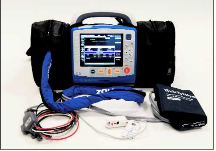
Zoll X Series

• We were fortunate to find a used ladder truck a year and a half ago to replace our 1985 Engine 2. Not only does Ladder 1 carry twice as much water, it has the added safety of an aerial device and an elevated master stream. Roof top operations like ventilating and chimney fires are far less dangerous with an aerial. Remarkably, we were able to buy this truck for $30,000. A new ladder runs around $900K.