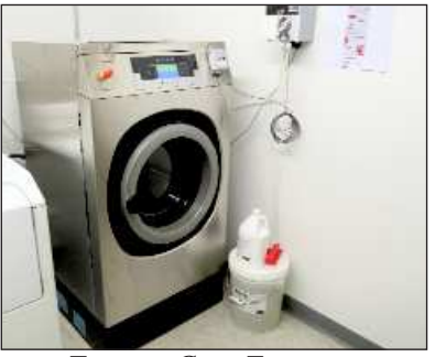
Turnout Gear Extractor

• We purchased a state-of-the-art Zoll X series monitor/defibrillator. This new monitor has diagnostic capabilities that are quick, reliable and were previously beyond our reach. This information is invaluable on a critical cardiac call. We purchased this $32,000 monitor entirely through fund raising... largely thanks to the very generous $10,000 gift from the Crotched Mountain Rehab Center. No tax dollars were used.