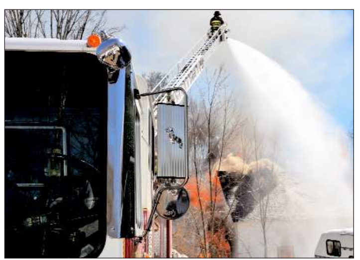
Greenfield's Mighty Ladder in Lyndeborough

• We have purchased four sets of turnout gear (structural firefighting protective clothing) each of the last three years. There are more sets coming at the end of this year, at which time, all our interior firefighters will be in safe, current "in date" gear.