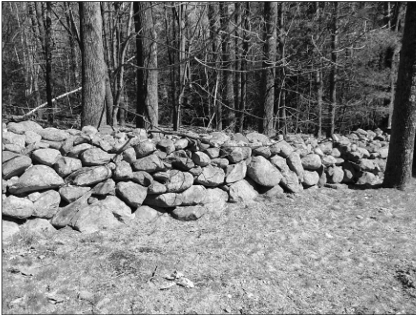
*At Risk* Historic Greenfield Stone Walls

Beginning at Town Meeting on March 17, 2012 the Planning Board passed out written surveys to those in attendance. Surveys were also available at the Harvester Market, Stephenson Library, Town Offices and the Greenfield Post Office. Within two weeks over 133 residents had responded; 77 in written surveys and 56 through our on-line version on the Town website. The difficult task of compiling the written surveys and synthesizing results with those of the on-line surveys was completed and that information was provided to Southwest Regional Planning Commission, our consultants, in early May. Those results are available on the Town website and at the Town Offices.