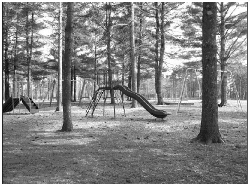
*Likes* Facilities at Oak Park