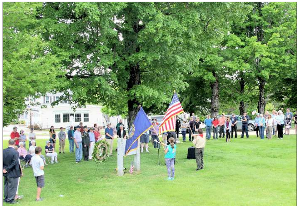
2019 Memorial Day Observance